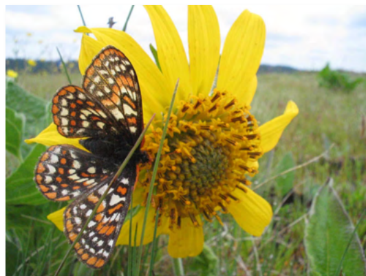
Taylor's checkerspot.

To watch Bugs That Rule the World visit https://www.pbs.org/show/bugs-that-rule-the-world/ and spread the word!