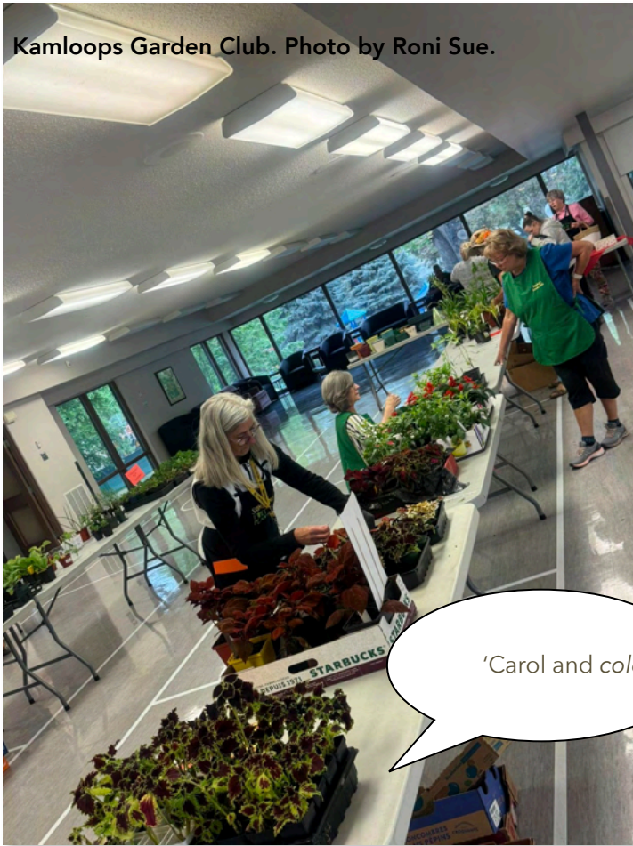
Kamloops Garden Club.