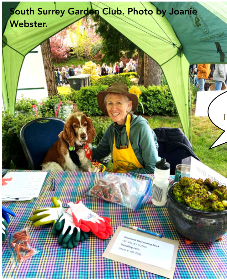
South Surrey Garden Club.