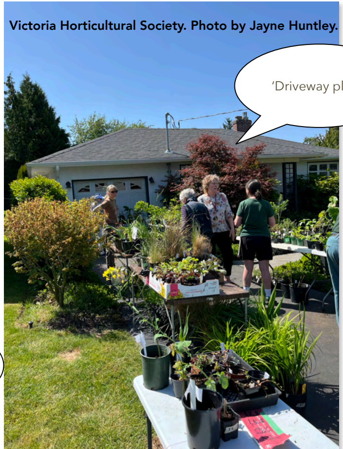
Victoria Horticultural Society.