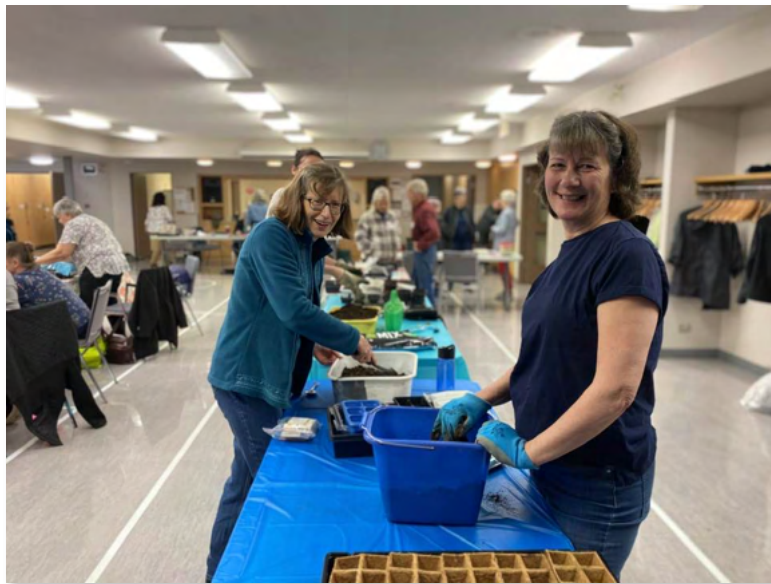
The Kamloops Garden Club annual March seed starting meeting.