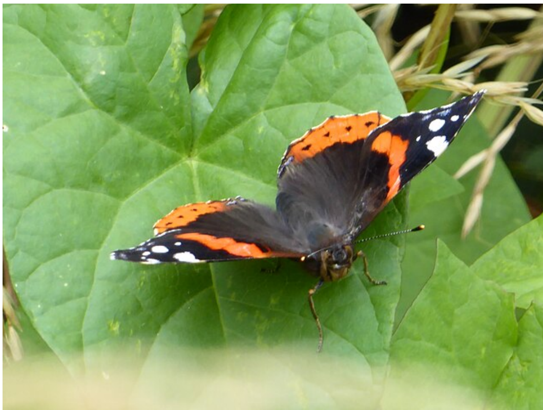
Red admiral butterfly and stinging nettle.